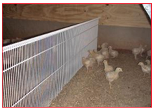
Figure 2: Example of a migration fence.

Migration fences ( Figure 2 ) installed at 30 m (100 ft) intervals, creating pens of equal size, will help maintain an even stocking density throughout the house. Fences should be installed as soon as birds have access to the whole house. Solid migration fences should not be used as they will restrict airflow.