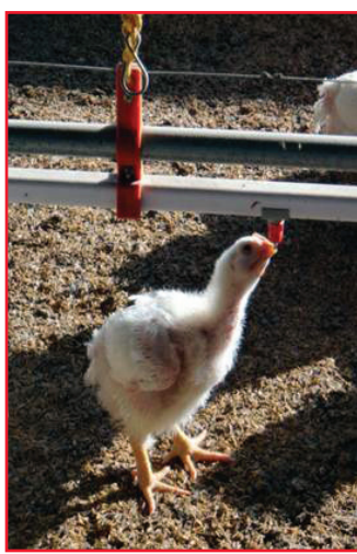
Figure 3: Correct nipple drinker height adjustment with bird age.