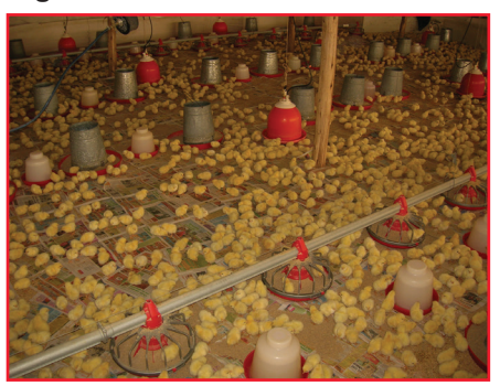
Figure 4. Chick behavior under different environmental conditions.

Chick behavior when environmental conditions are correct. Chicks are spread evenly throughout the brooding area.