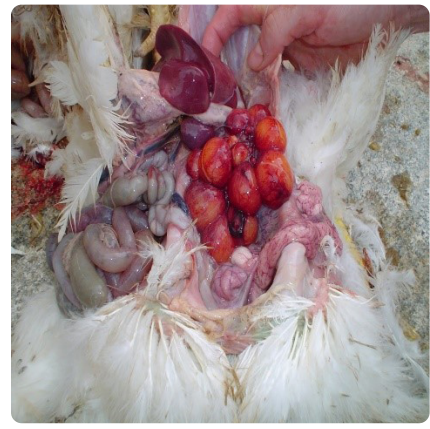
Figure 4. Too many follicles as a result of superovulation (EODES).

As a result of superovulation, erratic oviposition and defective egg syndrome (EODES) can occur ( Figure 4 ). EODES can progress further to oviduct impaction ( Figure 5 ), setting the stage for abdominal or internal laying and salpingitis-peritonitis ( Figure 6 ).