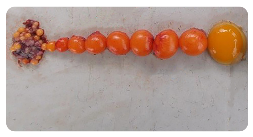
Figure 3. Multiple follicular hierarchies with the ovary.

A typical follicular hierarchy in control-fed breeding hens consists of the recruitment and development of no more than eight follicles. This phenomenon is known as multiple follicular hierarchies (Figure 3). These multiple follicular hierarchies can result in superovulation and the alteration of egg production. According to scientific research, for every extra follicle at sexual maturity, the bird produces ten fewer eggs during its productive life.