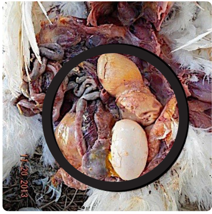
Figure 5. Salpingitis with caseous egg yolk from the oviduct.