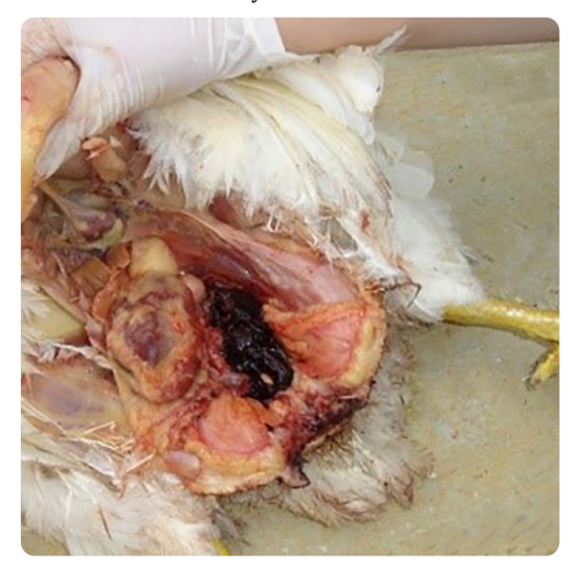
Figure 8. A peck-out that resulted in the extraction of internal organs. An internal blood clot is often observed upon necropsy.

Prolapse is commonly observed at the onset of production in flocks with poor body-weight uniformity. Prolapse and subsequent peck-out can result in cannibalism and occurs more often in Spring/Summer due to the excessive light stimulus. Feed increases that are too large after photostimulation and before peak production are associated with an earlier than desired start of production and higher rates of double-yolk eggs that can also cause cloacal prolapse. Therefore, small but frequent feed increases to peak feeding are recommended after photostimulation. Prolapse and peck-out have also been observed in flocks 40 to 50 weeks of age with excessive weight ( Figure 8 ). In this case, abdominal fat may alter the correct return of the cloacal mucosa after laying.