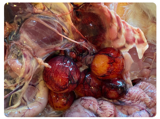
Figure 9. Calcium tetany - presence of partially or fully formed eggs in the oviduct with lung and follicular congestion.

Calcium Tetany or hypocalcemia (low blood calcium [Ca]) occurs in broiler breeders that have not started egg production and are fed high Ca levels (>1.2%). The high Ca levels trigger a metabolic mechanism (negative feedback) that limits optimal storage and Ca transport from the bone for eggshell formation. It typically occurs acutely with symptoms and clinical signs early in the morning, at the start of the day. Birds gasp and open their wings when hot, show weakness and depression, progressing towards paralysis and extension of the legs backward; sometimes, seizures can occur. As leg paralysis progresses and hens squat down in the scratching area, over-mating may occur, potentially leading to mortality. At necropsy, lesions are non-specific, often associated with active ovaries (multiple follicular hierarchies) and the presence of partially or fully formed eggs in the oviduct with follicular congestion ( Figure 9 ).