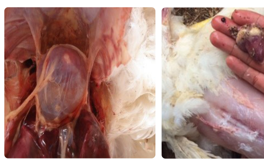
Figure 11. Hydropericardium associated with SDS.