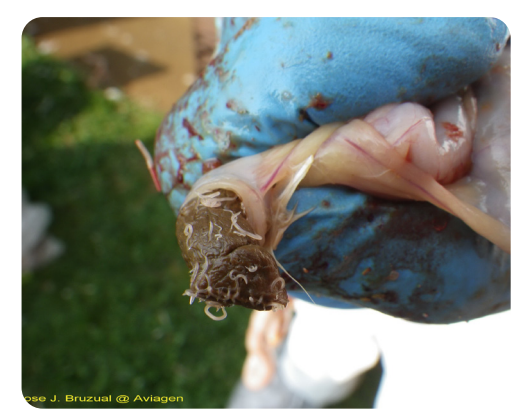
Figure 2. Cecal worms (Heterakis gallinarum) passed in feces.

In addition, crates used to transport birds must be cleaned, as birds have been shown to contract histomoniasis from equipment.