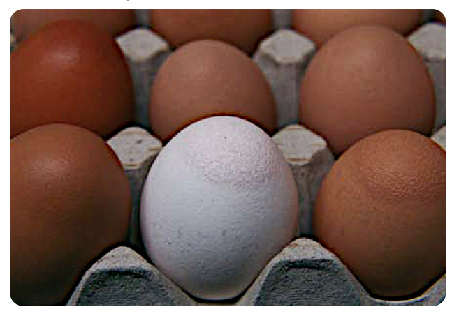
Figure 1. Egg shell abnormalities (EAA) or "top coning" caused by MS infection in hens.

MS has re-emerged due to a decrease in antibiotic (AB) use and the occurrence of more pathogenic strains. These strains can cause the typical synovitis issues (swollen joints and footpads), secondary respiratory issues (especially in broilers) and a fairly new effect on eggs called Eggshell Apex Abnormalities (EAA) or Top Coning (Figure 1) . EAA more often affects commercial layers but has also been seen in broiler breeders.