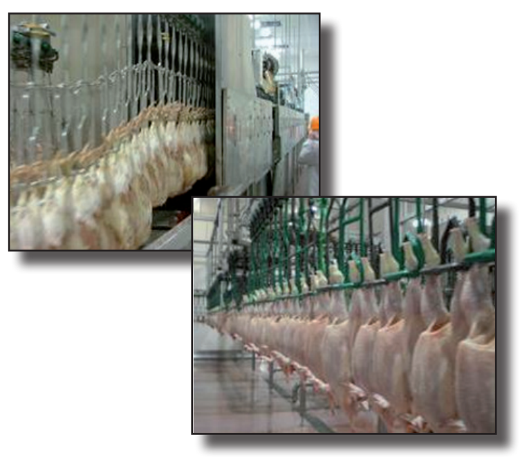
Figure 1: Clean birds showing no signs of fecal contamination on the processing line.

Feed withdrawal plans should be monitored and reviewed constantly and must be modified promptly if problems occur, but as a general rule of thumb, feed should be removed from the flock 8-12 hours before the expected processing time.