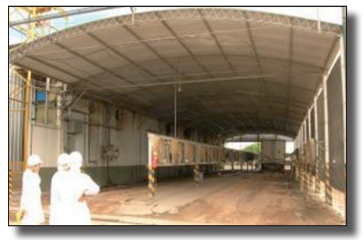
Figure 5: A holding area at a processing plant.

Fans can be used to help keep the birds cool and well ventilated in the holding area ( Figure 6 ). Fans should be positioned carefully to ensure a good even air flow through the crates. Appropriate spacing between the trucks, or inserting empty modules into the bird compartment of the truck, will help improve air-flow around the birds.