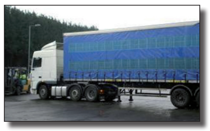
Figure 4: Example of a vehicle suitable for transporting broilers to the processing plant.

The micro-climate inside the bird compartment of the truck will be different to the temperature and humidity outside, and could be detrimental to the birds. This is especially true when the vehicle is stationary. Ventilation and extra heating and/ or cooling should be used when necessary. Stops during transportation should be minimized.