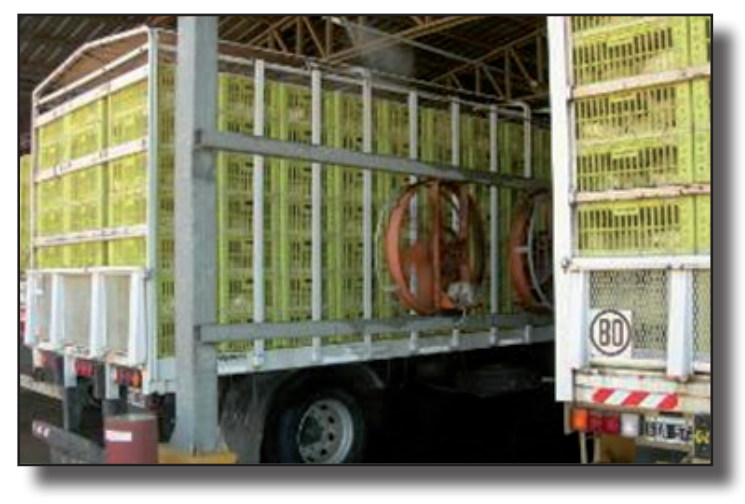
Figure 6: Fans being used in the holding area to keep birds cool.

During periods of high temperature, foggers can be used to help keep birds cool. Foggers must be well-maintained, and should not be used when relative humidity is greater than 70% because the capacity of birds to lose heat will be compromised. If foggers are used, it is important to make sure birds are dry when placed on the processing line. If birds are wet, the effectiveness of the electrical bath stunner may be reduced - compromising bird welfare and carcass quality.