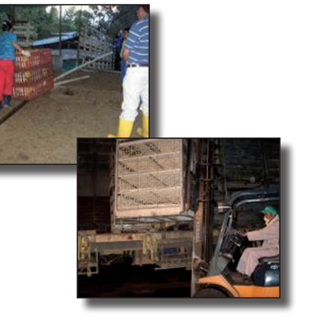
Figure 3: Using a forklift or PVC pipes to ease manual catching.

Catching crews must be properly trained in bird handling and welfare. Birds should be caught carefully, and held by both shanks, or by the breast with both hands to minimize distress, damage and injury (e.g. bruising or hip and wing dislocations). Clear guidelines on bird handling must be in place and the catching process should be monitored and reviewed regularly.