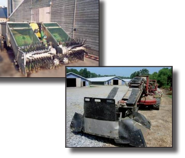
Figure 9. Examples of mechanical harvesters.

Methods of manual catching vary from country to country depending on equipment and labor availability. Manual catching crews typically catch and crate between 7,000-10,000 birds an hour. However, personnel can be subject to fatigue and may perform inconsistently during a shift. The use of forklift trucks to bring transport modules into the house, or PVC pipes to aid movement of transport modules through the house ( Figure 3 ), can make manual catching easier.