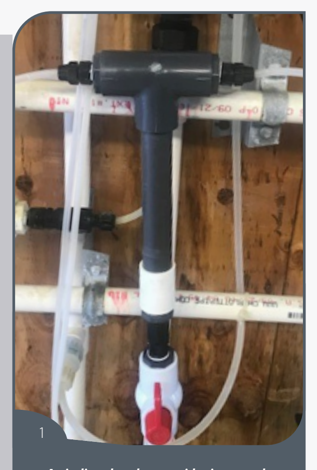
An in-line chamber provides improved reaction time for chlorine dioxide.