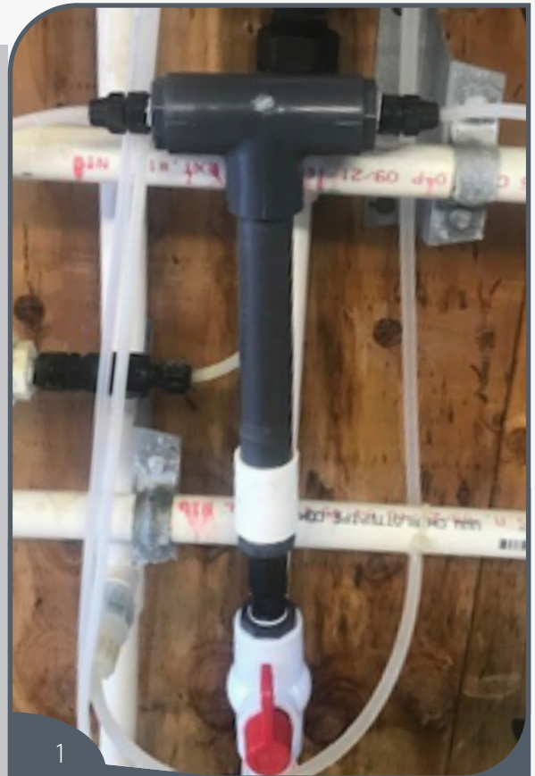
1 An in-line chamber provides improved reaction time for chlorine dioxide.